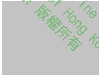
Plate 14 (top) Irene Chou, The Universe Lies Within , ink and colour on paper, 78x124cm, 1997