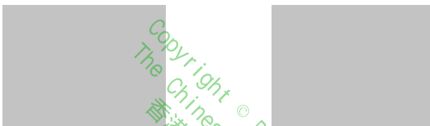
Plate 11 (Left) Irene Chou, Infinity Landscape , ink and colour on paper, 243.8x61cm, 1987